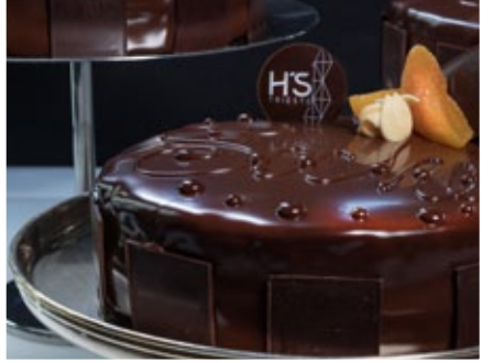
GULF OF TRIESTE